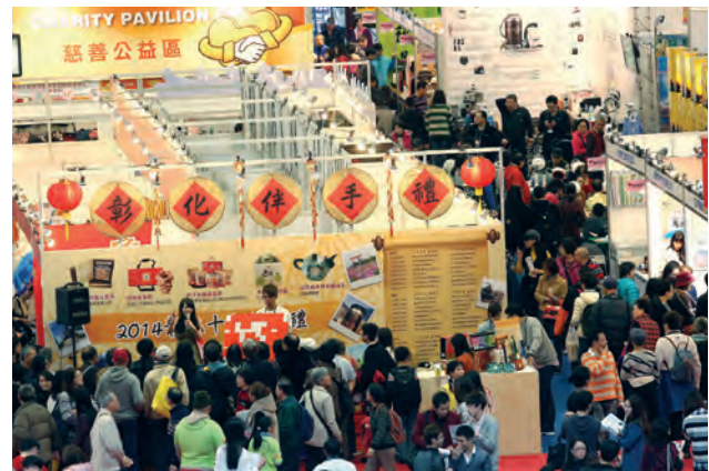
Visitors flock to the Charity Pavilion