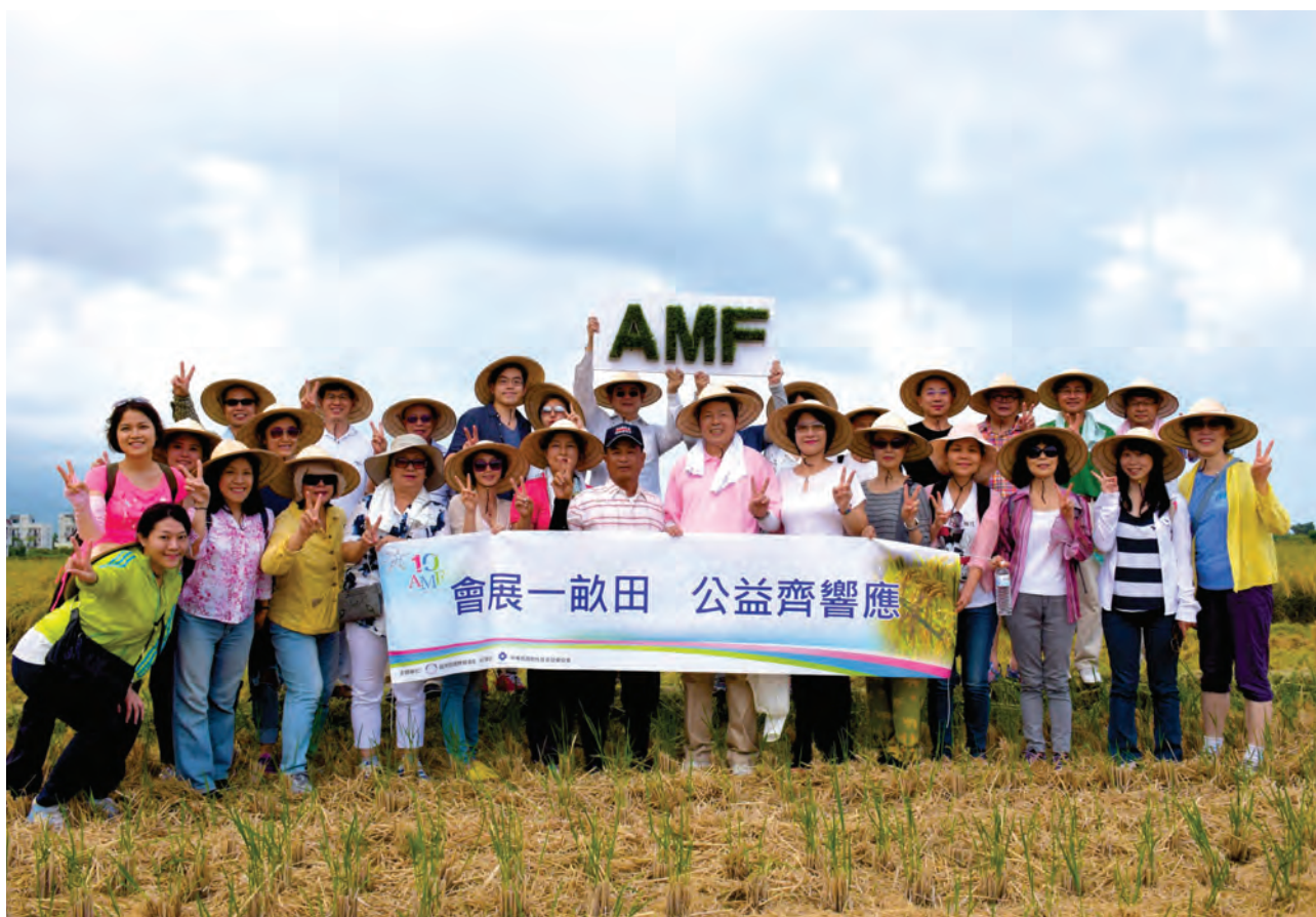
AMF 2015 enhances the concept of CSR in Taiwan's MICE industry

The Taiwan Excellence "Around the World" Online Charity Run is an online marathon game implemented by TAITRA in Indonesia, India, China, Brazil, Germany and Turkey. The