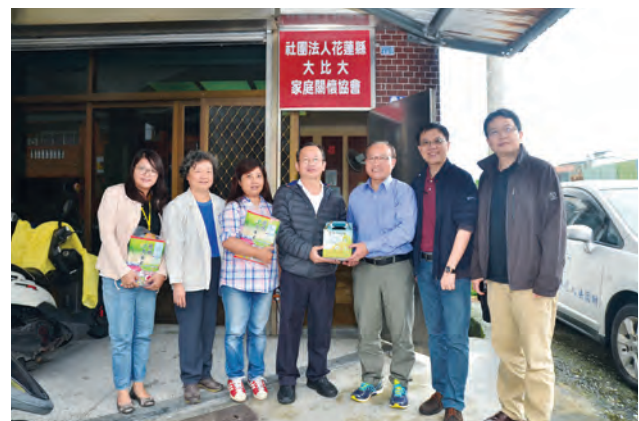
TAITRA presents Tabitha Family Care Association with donations and rice